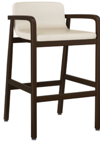
Model: MddbST111 22W 23.5D 37.75H 19.5SW 18SD 29.5SH 34AH

Chic and minimalist, the pre-molded seat of the Madrid Bar Stool has no separation, retains its shape, is smooth and comfortable. The seat fits inside the stool frame, made of easily cleaned Classic Kwalu material with stretchers on all sides. The Madrid is suitable for use at bars, counters, and high tables.